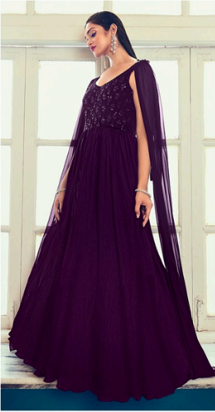
CODE + 4961