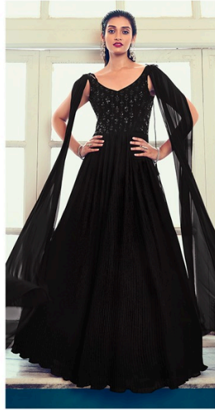
CODE + 4963