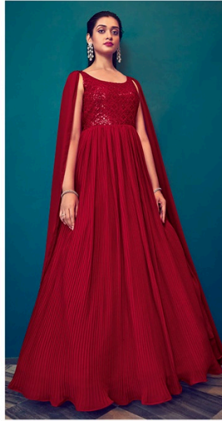
CODE + 4962