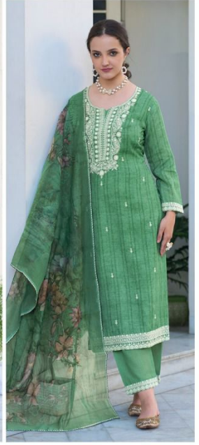
→ 1182 ←