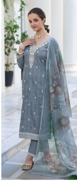
→ 1180 ←