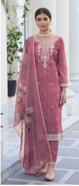
→ 1179 ←