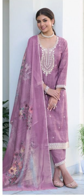
→ 1181 ←