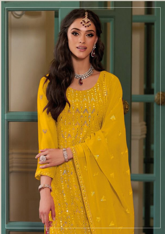
A woman should be two things, classy and fabulous