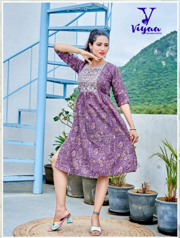
With its richly embroidered border and facets, this gorgeous green curvo perfectly enhances the feminine silhouette.