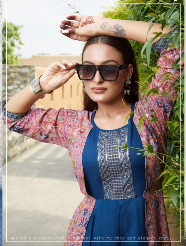
Making a professional statement with my chic and elegant kurti..