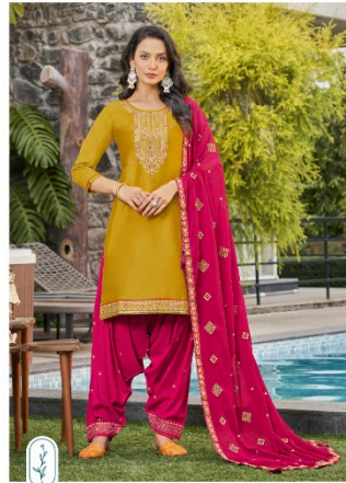
DESIGN NUMBER 13893