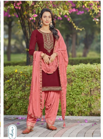
DESIGN NUMBER 13892