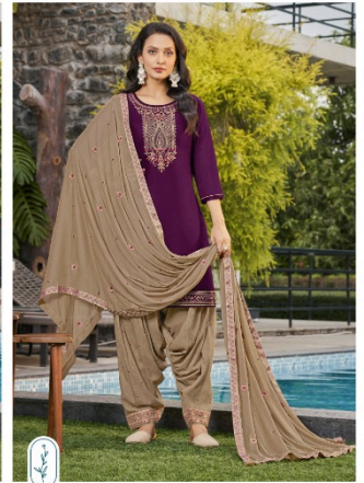
DESIGN NUMBER 13894