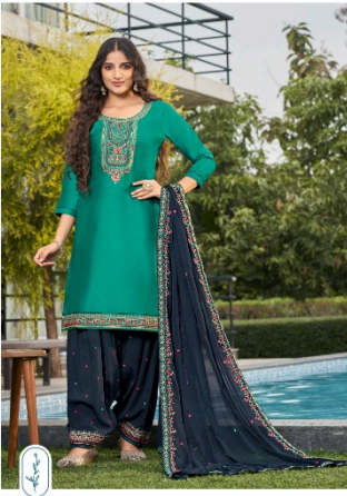
DESIGN NUMBER 13889