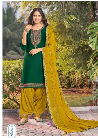
DESIGN NUMBER 13891