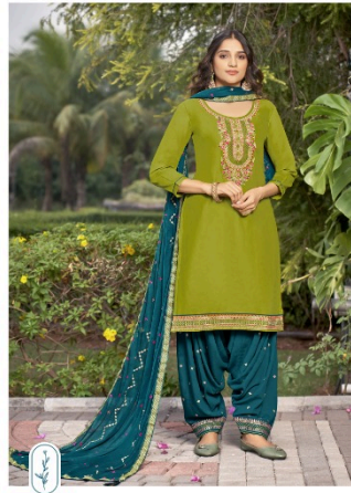
DESIGN NUMBER 13890