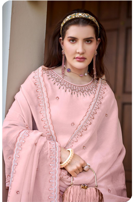
REFRESHES IT'S DRESSES WITH BOLD DESIGN